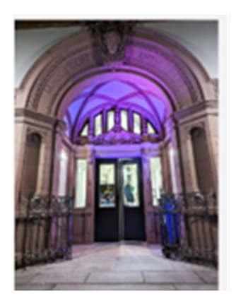
Day 3 - Heimathafen - Schwurgerichtssaal Karlstraße 22, 65185 Wiesbaden