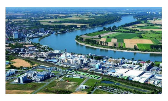
Day 5 - Ryon GreenTech Accelerator at Fluxum GreenTech Parc Gernsheim Mainzer Straße 41, 64579 Gernsheim