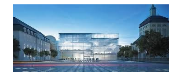
Day 2 - Merck Innovation Center Frankfurter Straße 250, 64293 Darmstadt